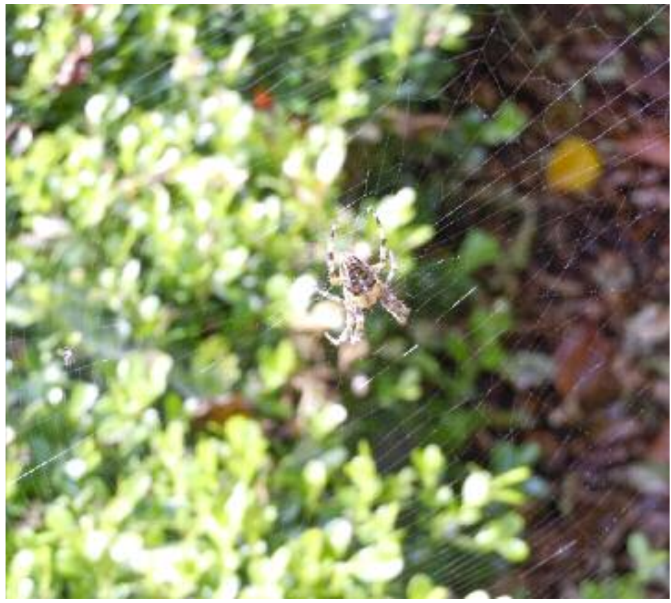
An argiope spider weaves its web to catch its prey.

Happy Halloween to all the witches, warlords, pirates, princesses, paupers, pumpkins and pilgrims!