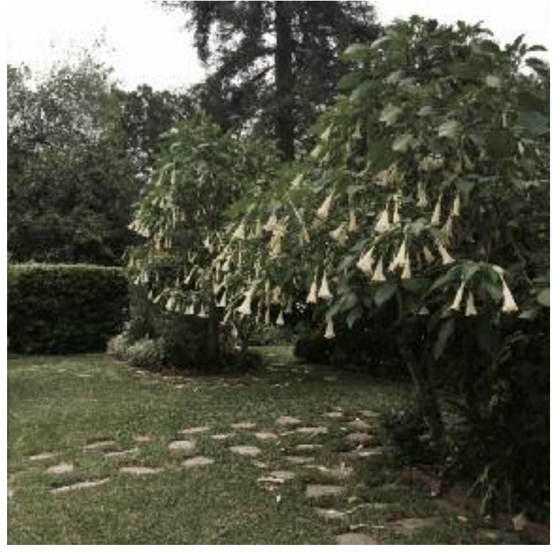
A Hansel and Gretel path to the deadly Angel Trumpet Bush